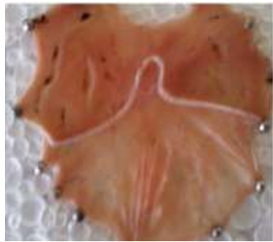
a) Control (P.L.) shows severe damage

Values are expressed as mean ±SEM of 5 observation, statistical comparisons as follows: significant at ***P<0.001 as compared to control