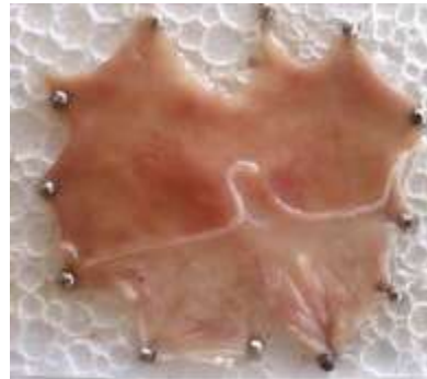
d) hydroalcoholic extract of Cp1 (200 mg/kg) Shows protected mucosal layer