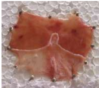
c) hydroalcoholic extract of Cp2 (400 mg/kg) Shows protected mucosal layer