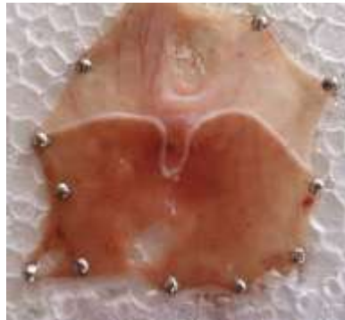
e) Aqueous extract of CpA (300 mg/kg) Shows protected mucosal layer