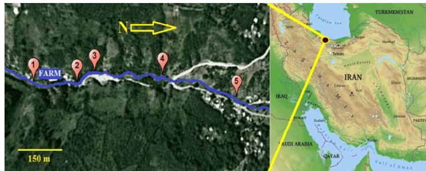
Fig. 1: Study reach in Daryasar Stream. Stream location of the trout farm and sampling stations (s1, s2, s3, s4 and s5)

Results of physicochemical parameters measurements in Daryasar Stream are presented (Table 1). As indicated,