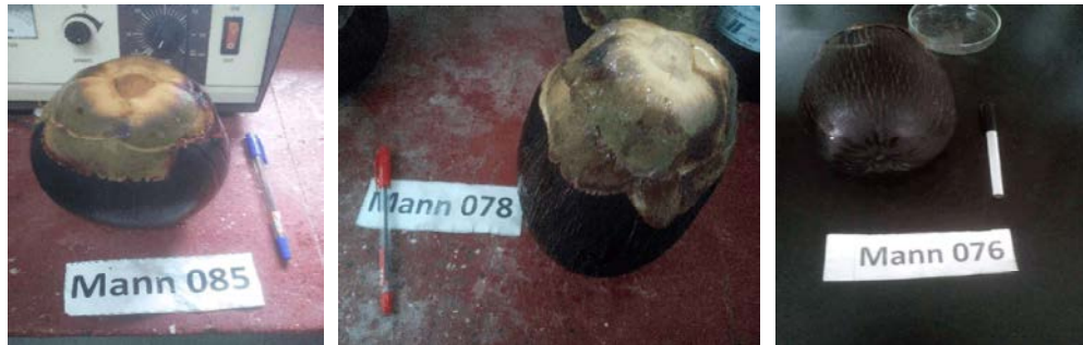
Fig. 1: Different morphological shapes of palmyrah fruits

Data refer to mean values (n = 100) ± standard deviation. CV: coefficient of variation.