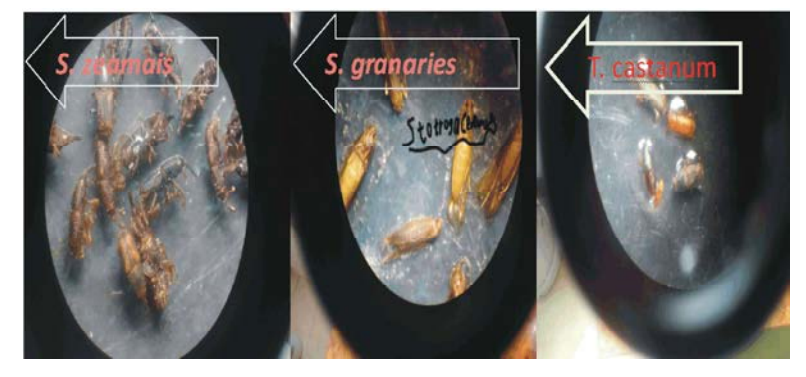
Fig. 4: Weevil's species identified in the laboratory from the 500 gm samples

Note: Means with the same letter were not significantly different by LSD test at P ≤ 0.05, P≤0.001, CV: coefficient of variation, LSD: least significant different