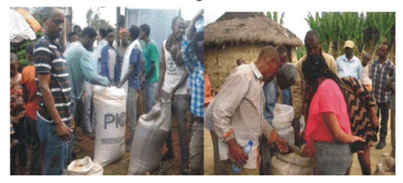
Fig. 2: Theoretical and practical workshops training, demonstrations and audio-visual discussions