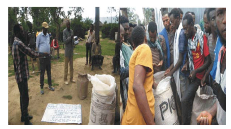
Fig. 1: On Farm Demonstration and Promotion of PICS bag Structures