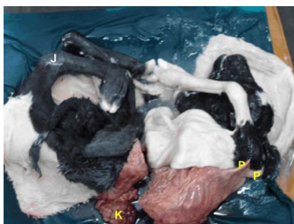
Fig. 3: Schistosomus reflexus fetus after incision of the skin covering the hind limbs and the pelvis and that covering the head, neck and forelimbs. Notice the ankylosed joints of fore limbs (J), two prominent processes (P) and the kidney (K)

enclosed within another membranous sac (Fig. 1). Each sac was incised; the inner surface of these membranous sacs was completely covered with hairs confirming that these sacs are the reflected skin. Previously, head and limbs of SR foetai were encapsulated within the reflected skin [8, 9]. Each side of reflected chest and abdominal skin might have fused with its other side forming two separate sacs, one enclosed the head and the fore limbs and the