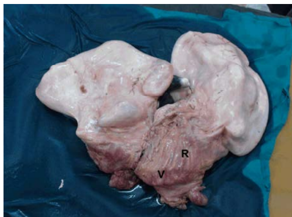
Fig. 1: Schistosomus reflexus fetus was delivered by fetotomy. With the exception of the chest and abdomen, the fetal parts are completely covered by 2 separate thick membranous sacs. Note the dorsally reflected chest ribs (R) and ventral curvature of the vertebral column (V)