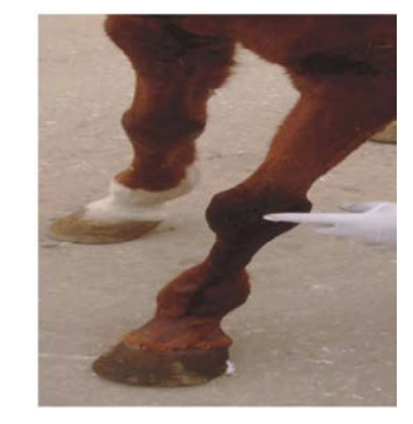
Photo 1: Swelling in both the carpal and fetlock joints due to acute arthritis in thoroughbred horse

Concerning the clinical signs, most of the affected horses with musculoskeletal affections exhibited lameness, stiff gait and off food followed by fever and pain as well as swelling. Horses of different groups showed X-ray and ultrasound abnormalities with different degrees (Table, 2 and Photos, 1-6). The observed lameness and joint swelling (In arthritic horses) could be attributed to the initiation of an inflammatory process that caused synovitis and capsulitis [29]. The observed signs were similar to those described by El-Deeb and El-Bahr [30].