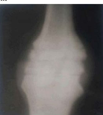
Photo 5: Anterior posterior X-ray image of carpal joint showing osteoperiostal reaction (Chronic arthritis).