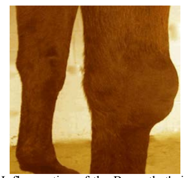
Photo 3: Inflammation of the Bursa that's in front of the carpus and not of one of the carpus joints.