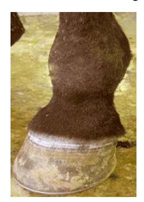
Photo 2: Inflammation of the fetlock region including fetlock joint.