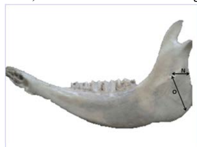
Fig. 4: Mandible of the Iranian buffalo; medial view. N: Caudal border of mandible to the level of mandibular foramen, O: Mandibular foramen to mandibular angle.