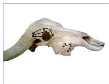
Fig. 1: Skull of the Iranian buffalo; lateral view. A: The base of horn to caudal border of orbit, B: The base of horn to mid-level of dorsal arch of orbit, C: The base of horn to rostral border of orbit. D: Facial tuberosities to infra-orbital canal, E: Infra-orbital canal to root of alveolar tooth.