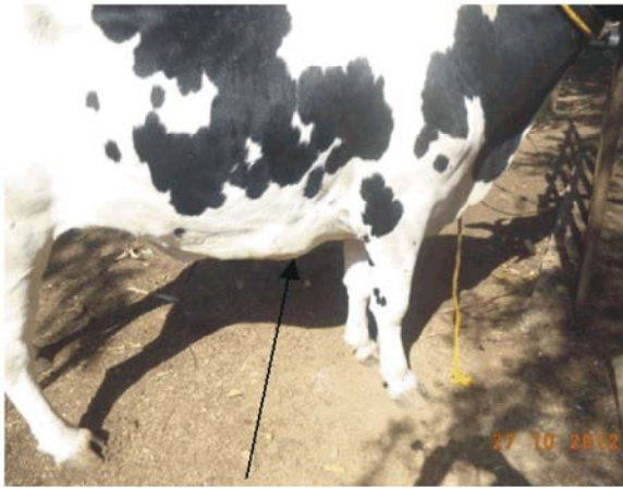
Fig. 2: Abscessation behind the elbow (source: [22]).

straining and mounting during estrus increase the likelihood of an initial penetration of the reticulum and may also disrupt adhesion caused by an earlier penetration [7].