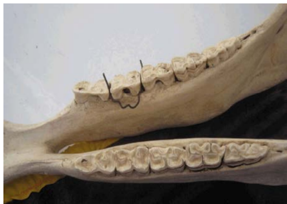
Fig. 1: Wire wedged between premolars.

Etiology: Cattle commonly swallow foreign objects, because they do not use their lips to discriminate between materials and they do not completely chew their feed before swallowing. Sharp metallic objects, such as nails or wire, are the common causes of hardware disease. The object travels into the rumen and is then pushed into the reticulum along with the rest of the feed. In some cases, contractions of the reticulum can push the object through part of the reticulum wall into the peritoneal cavity, where it causes severe inflammation [16].