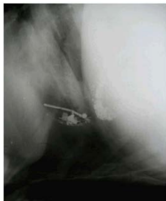
Fig. 3: Lateral radiograph of reticulum showing clearly demarkable diaphragmatic line and presence of potential and non-potential metallic densities cranial to diaphragm (Source: [18]).

Commonly it is the reticulum which herniates into the thorax, however the omasum, abomasum, loops of intestine, spleen or liver may also herniated without exhibiting additional specific clinical sign [19].