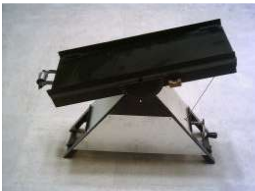
Fig. 2: Apparatus to determine static coefficient of friction