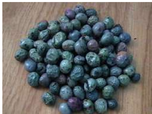
Fig. 1: Mutica wild pistachio ( Pistachio mutica L.)

The aspect ratio (Ra) was calculated by Omobuwajo et al. [14].