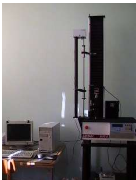
Fig. 4: A universal testing machine (Santam, MRT-5) to determine failure properties of fruits

plate was inclined gradually allowing the kernels to follow and assume a natural slope [15]. The dynamic angle of repose is the angle with the horizontal at which the material will stand when piled. The angle of repose was determined using a hollow cylinder and then trigonometry rules.