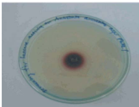
Fig. 1: The Bacillus subtilis strain showed the Laccase Screening activity on Guaiacol amended Agar plate assay Dark brown colour indicate laccase

Isolation and Screening of 2, 4 Dichlorophenol Degrading Bacteria: The soil samples collected from the dyeing industry areas of Erode in Tamil Nadu, India, were serially diluted and dilution factor 10 -4 , 10 -6 and 10 -7 were used for isolation of bacteria. A total of approximately 2400 bacteria were screened, around 200 from each sample, out of these 13 isolates showed 2, 4-Dichlorophenol degrading activity as demonstrated by the dark reddish brown colour colonies. The isolate which revealed highest degradation ability was selected for further characterizations (Figure 1).