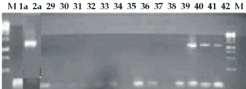
Fig. 3: Amplified DNA banding patterns showing the presence and absence of xa-13 gene in advance lines.

Lane M = 1kb plus DNA ladder, Lane 1a=IR 24, Lane 2a = IRBB59, Lane 15 = ECIA-67-SI-JI-5, Lane 16 = RP-2235-114-84-21, Lane 17 = IR-59606-119-3, Lane 18 = IR-62873-469-2-9, Lane 19 = IR-52350-81-3-1-2, Lane 20 = IR-56381-139-2-2, Lane 21 = MILYANG-55(SAM GANGBYEO), Lane 22=KAOH SIUNG SEN YU 338, Lane 23=RP-1670-1481-2205-1585, Lane 24=IR-62871-73-2-3, Lane 25 = IR-62871-175-1-10, Lane 26 = IR-62871-439-1-3, Lane 27 = IR-62871-469-1-2, Lane 28 = Lawangai/Bas:385//Bas:385-1S-2S.