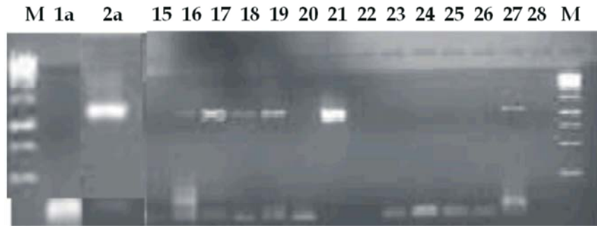
Fig. 2: Amplified DNA banding patterns showing the presence and absence of xa-13 gene in advanced lines.

Lane M = 1kb plus DNA ladder, Lane 1a=IR 24, Lane 2a = IRBB59, Lane 15 = ECIA-67-SI-JI-5, Lane 16 = RP-2235-114-84-21, Lane 17 = IR-59606-119-3, Lane 18 = IR-62873-469-2-9, Lane 19 = IR-52350-81-3-1-2, Lane 20 = IR-56381-139-2-2, Lane 21 = MILYANG-55(SAM GANGBYEO), Lane 22=KAOH SIUNG SEN YU 338, Lane 23=RP-1670-1481-2205-1585, Lane 24=IR-62871-73-2-3, Lane 25 = IR-62871-175-1-10, Lane 26 = IR-62871-439-1-3, Lane 27 = IR-62871-469-1-2, Lane 28 = Lawangai/Bas:385//Bas:385-1S-2S.