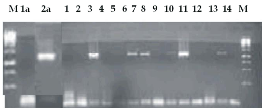
Fig. 1: Amplified DNA banding patterns showing the presence and absence of xa-13 gene in advanced lines.

Lane M = 1kb plus DNA ladder, 1a=IR 24, Lane 2a = IRBB59, Lane 1 = IR-31787-41-2-2-3-3, Lane 2 = IR-32307-107-3-2-2, Lane 3 = IR-39357-133-3-2-2-2, Lane 4 = IR-50, Lane 5 = IR-25340-64-1-3-1S, Lane 6 = Kas-Bas/DG.WG, Lane 7 = IR-31837-11-2-2-1-2, Lane 8 = ECIA-66-84-1-1-1, Lane 9 = RP-1669-1529-4254, Lane 10 = RGP-1335/IR21841-81-3-2-1S, Lane 11 = RGP-1335/IR-21841-81-3-2-2S, Lane 12 = IR-44592-1-3-2-4, Lane 13 = RP-2263-2556-2, Lane 14 = BR-601-3-3-2-4.