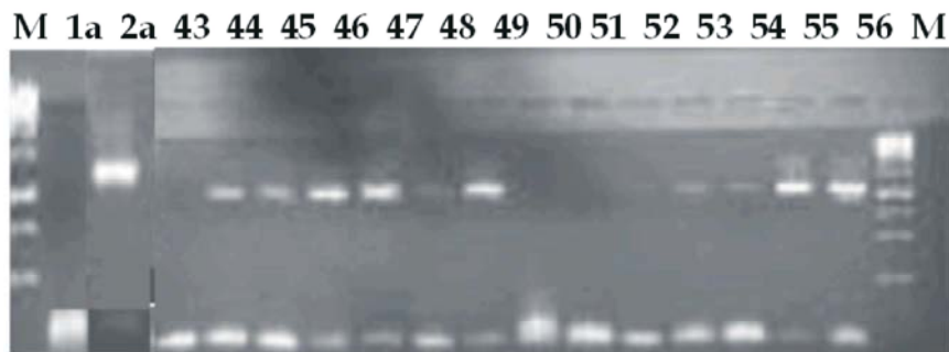
Fig. 4: Amplified DNA banding patterns showing the presence and absence of xa-13 gene in advance lines.

Lane M = 1kb plus DNA ladder, Lane 1a=IR 24, Lane 2a = IRBB59, Lane 29 = HSINCHU-64, Lane 30 = CT.8665-1-16-8-1, Lane 31 = IR-57313-106-2-3, Lane 32= IR-62127-55-1-2-2-3, Lane 33 = IR-62164-32-2-2-2-1, Lane 34 = NANJING-57161, Lane 35 = NANJING-67022, Lane 36 = RP-2633-30-4-7, Lane 37 = Y.R.L/L-202-6S-5S-1S-1S, Lane 38 = Y.R.L/L-2026S-5S-1S-2S, Lane 39 = BG-1639, Lane 40 = DAK-83-99-27-3, Lane 41 = J-P-5/L-202-7S-1S-2S, Lane 42 = PARC-89(NIMAT),.