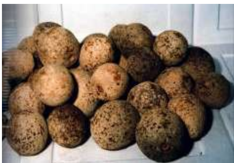
Fig. 1: Wood apple

The wood apple is native and common in dry plains of India and Ceylon. Wood apple is used in the preparation of chutneys and for making jelly and jam [7]. Wood apple has got high medicinal value. Every part of the fruit has got its medicinal property. The Fruit is much used in India as a liver and cardiac tonic and when unripe, as a means of halting diarrhoea and dysentery and for effective treatment for hiccough, sore throat and disease of the gums [8].