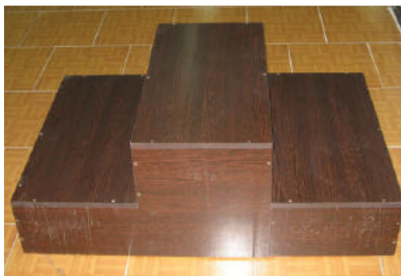
Fig. 1: Custom-made stair platform

Exercise Intervention: After the testing procedures, the subjects of exercise group were instructed to perform the exercises. Control group was asked to