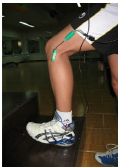
Fig. 2: The ascent phase of the stair-stepping task

continue their activities of daily living. Exercise program included three exercise sessions per week for six weeks (Table 1). At the beginning of each exercise session, the patients performed warm-up by stationary bicycle for five minutes. At each exercise session, five exercises were performed. Exercises 1 to 4 which were used to strengthen the quadriceps and especially vastus medialis oblique were performed during all six weeks, but exercises 5 and 6 were performed intermittently within three weeks. Exercise program is provided in Table 1.