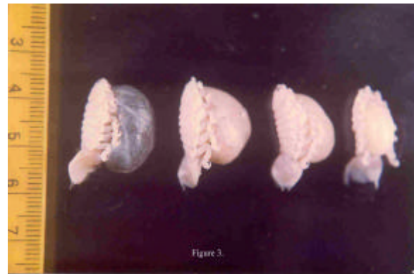
Fig. 3: Developmental stages of marsupium with manaca larva

Though most adult isopods on fish belong to the Cymothoidae, there are parasitic forms in other families. The Aegidae, distinguished from Cymothoidae by having less modified pereopods, includes the notorious Alitropus typus , which parasitises fishes in India and south-east Asia in fresh and brackish waters. The parasites attack fish to feed but retain their free-swimming capability as adults. Unlike cymothoids they do not appear to be protandrous hermaphrodites. Tridentellid and corallanid isopods are mostly free living but have a few representatives that are parasites of fish, such as the corallanid Argathona macronema which is common in the nasal passages of serranids and lutjanids on the Great Barrier Reef. Some corallanids are parasitic on Crustacea. Those belonging to the genus, Tachaea , are parasites of freshwater shrimps in Asia and Australia and are usually found attached to the outside of the cephalothorax.