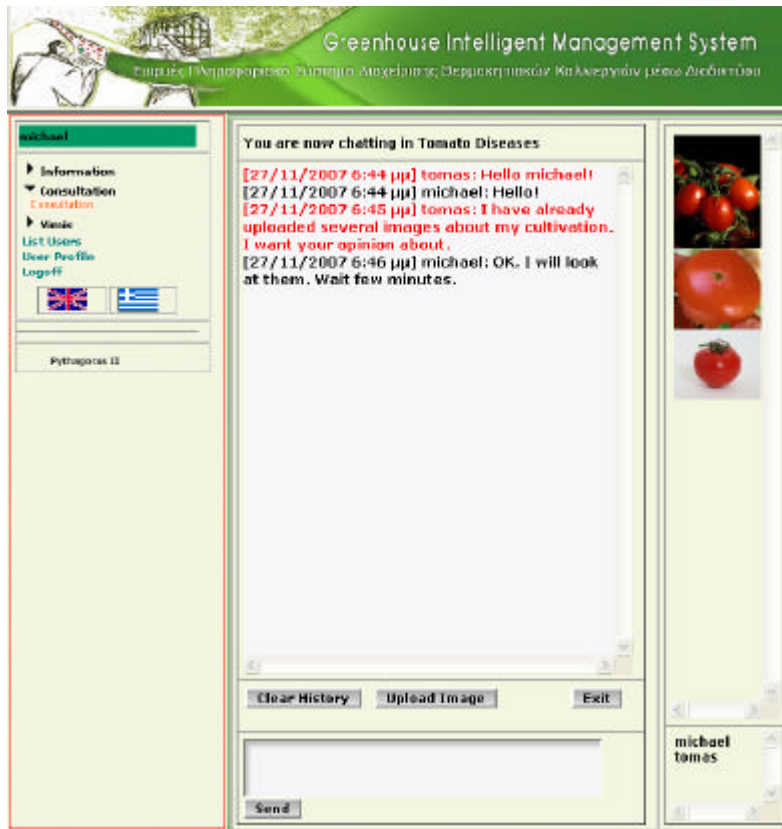
Fig. 3: Consultation module snapshot

The whole conversation process, including uploaded files, can be saved by the session owner in a DSpace 4 repository for future reference. DSpace is an open source software platform that enables organizations to capture, describe and preserve digital assets and provides