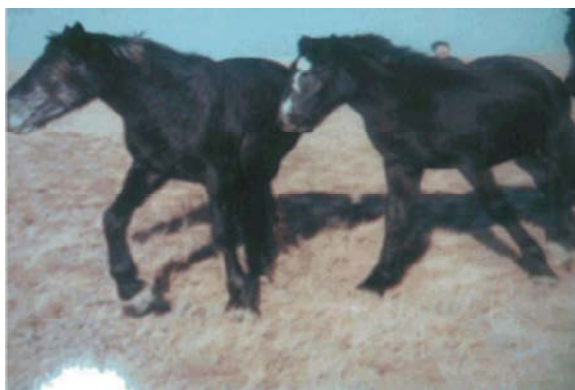
Fig. 2: Mixed young 7 months before slaughter

Currently, in KKH "Turar", there are 96 crossbred calves of \frac{1}{2} pedigree, including 38 of the colts and 58 fillies which is the backbone of the breeding group. In the future, hybrids of the second generation are envisaged to breed "in itself", with the aim of creating new productive lines, meat and milk type of the Kazakh breed of horses.