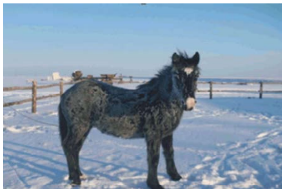
Fig. 3: Mixed young 18 months of age