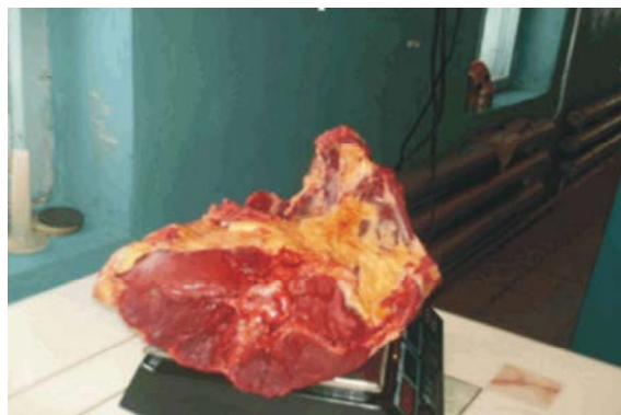
Fig. 4: The weighing of the cuts 18 - month-old crossbred calves on the electronic scales