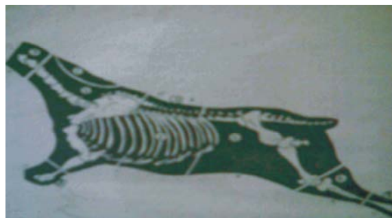
Fig. 1: Diagram of cut carcasses of horse (PCT of Kazakh SSR 725-72)

Lines cut off desperately relating to the third class, passes between the occipital bone and the first cervical vertebra, the posterior border of the desperate cut is between the 2nd and 3rd cervical vertebrae. The front of the shank is separated by the line through the middle of the ulna and radius, the Shin part of the lower half of the elbow and the lower half of the radial bone and wrist. The shank is separated across the back of the tibia at the level of 2 cm above the Achilles tendon. The rear shank includes the lower half of the tibia and hock.