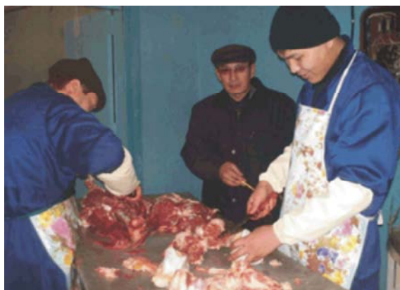
Fig. 5: Deboning carcasses of young animals