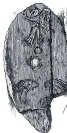
The image on the shield of a warrior on the Arch of Constantine. Detailed drawing by I.V. Kirsanov.

On a miniature in the sixth chapter (n. 9) of Eastern part of the Notitia dignitatum [4], there is an insignia of the Cornuti in the form of two snakes looking at each other and rising on the common base. One can see a similar symbol on the shield of a warrior depicted on the Arch of Constantine and on the shield of bronze statuette of Constantine from Princeton. F. Altheim connects these images with the figures of two dancing snakes that often decorate German arms [5].