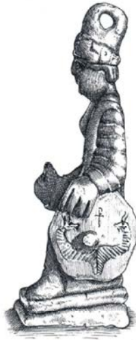
Bronze statuette of Constantine from Princeton. Detailed drawing by I.V. Kirsanov.

The warchiefs of tribes which lived in the territory of Denmark and Sweden in the 3 rd century frequently used these symbols. The items with detailed images were often dedicated to the god of war [6]. Thus we can assume that the Cornuti and some other Roman auxilia having similar symbols were formed of northern Germans, possibly captive. There was an opinion in Roman Empire that the strongest and fiercest warriors lived in northern countries. Consequently, before Constantine, Romans could recruit mercenaries on the North Sea coast- the territories of modern Denmark and Schleswig-Holstein [6]. This conclusion is proved by the words of a panegyrist who asserted that Constantius Chlorus recruited soldiers in the lands Romans did not reach and settled them in Gaul. That is why he could recruit some Roman detachments just in these northern regions [6].