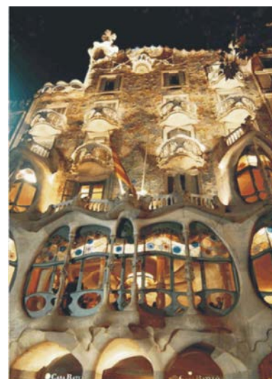
Pic. 3: Antoni Gaudi, Balio Building, Passeig-de-Gracia