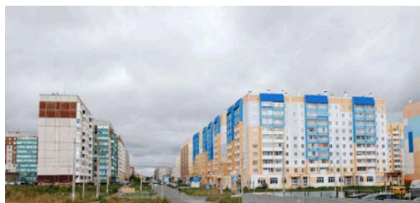
Pic. 7: 144 Residential area, Magnitogorsk, Chelyabinskaya region, Russia

Knowing particular color functions and techniques of using them it is possible to create harmonic color solutions and modify surrounding in order to partially satisfy material and spiritual needs, it shall also help in positive effect on people and their psychophysical feelings.