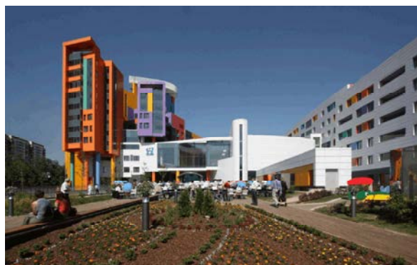
Pic. 1: An example of original color solution in architectural town planning project engineering

problematics which is outside the borders of various knowledge and activity spheres. Question regarding the use of colors have always been a major component in the process of organizing human objective environment. The role of colors in our everyday life is diverse, conditions require expansion of object types in objective dimensional environment, including new types, functional upgrades and renovation of the existing ones. Colors are a part of structural thinking, they are components of objective dimensional environment as well as elements of material and spiritual cultures.