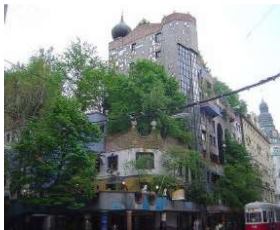
Pic. 4: Hundertwasser's House, Vienne, Austria