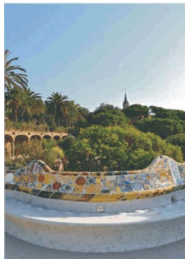
Pic. 2: Antoni Gaudi, Guell Park, Round Bench

Austrian architect Friedensreich Hundertwasser is equally interesting for our research, he is the following ideological successor of A. Gaudi, he realized principles of humanistic architecture not only using ecologically friendly materials, biomorphic architectural effect and