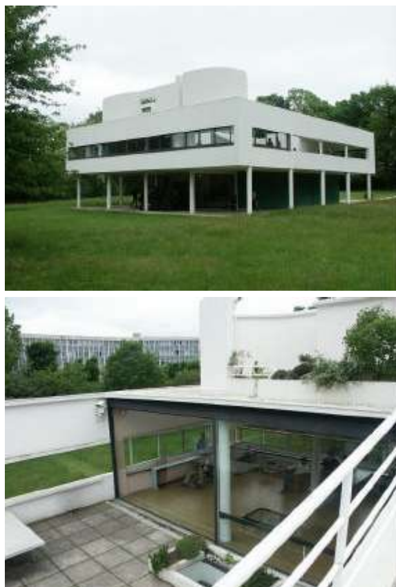
Pic. 5-6: Villa Savoye in France by Le Corbusier