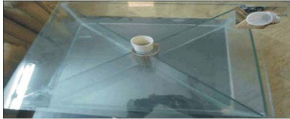
Air tight glass box with four chambers and 16 \times 16 \times 6 cubic inches volume capacity N = 100 adults red flour beetles released by central pipe for every replication