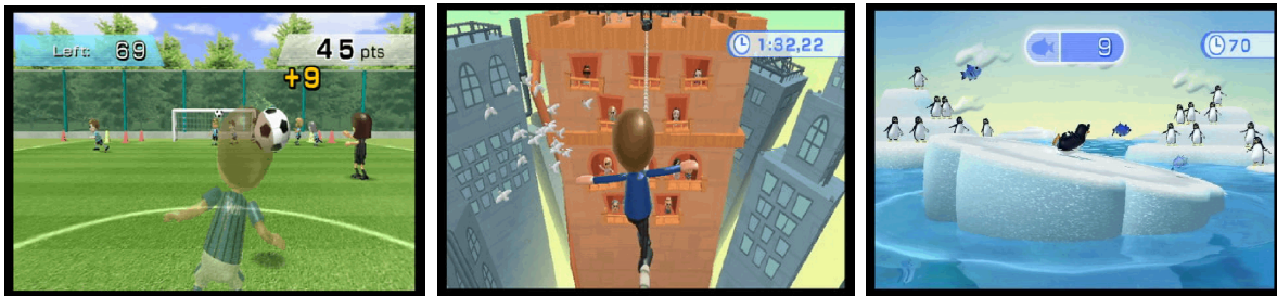
Fig. 1: Soccer heading game (A), Tight rope walk game (B) and Penguin slide game (C).

Data Analysis: The first three items of the BOTMP was determined by the number of seconds, up to a maximum of 10 seconds, the subject could perform in each of the three items. In items 4 through 7, balance was determined by counting the number of steps, up to a maximum of six steps, taken during each item. Item 8 was rated as pass or fail. Raw scores were converted to point scores. According to the BOTMP manual, the eight items measure balance with a total point score of 32. The total point score of balance for each child was the summation of the point score of the eight tested items of the balance subtest.