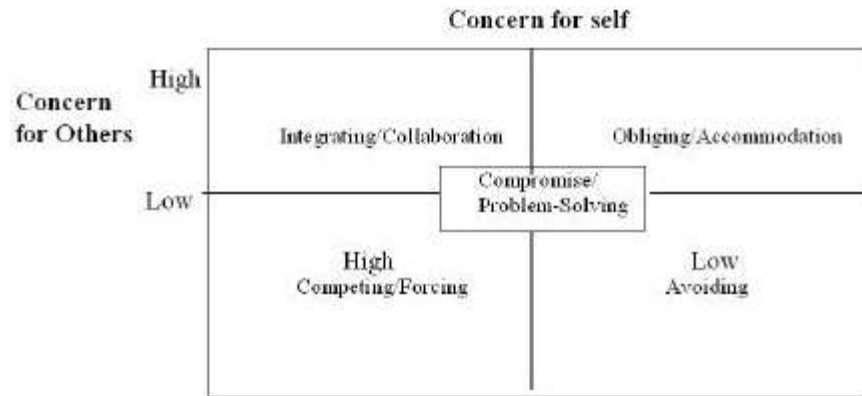
Fig. 2: A Two Dimensional Model of Five Interpersonal Conflict Management Styles