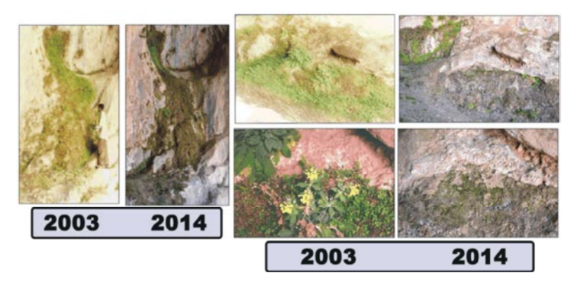
Fig. 1: Deterioration of Primula boveana population in the last ten years.

species are damaged and/or fragmented by mismanagement and various other human activities, the distribution ranges, population sizes and genetic variability of the species will be reduced and its members will become vulnerable to extinction at a faster rate than other species. Species with any one or more of the above attributes must be carefully monitored and managed in an effort to maintain biodiversity [36].