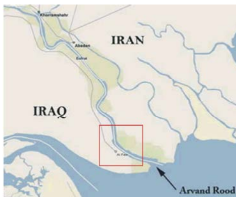
Fig. 3: Location of crime focus in the Arvand

All of the above mentioned set of reasons caused one to third reduction of crimes in 2007 to 2011. This strategic canal by Iran efforts has made to a safe canal for trade trafficking toward the ports.