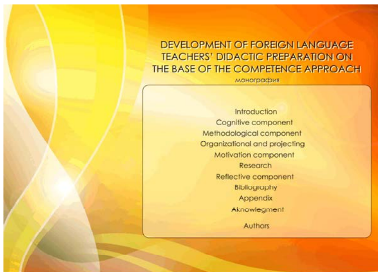
Fig. 3: “Development of foreign language teachers' didactic preparation on the base of the competence approach”.

All course's components thematic focus, supporting material were prepared for each component, glossary, lectures, multi-level tests, workshops, multimedia technology can improve the didactic training of foreign language teachers with research competence and creativity and innovative teaching techniques.