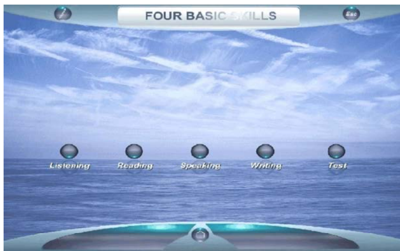
Fig. 1: "The course structure."