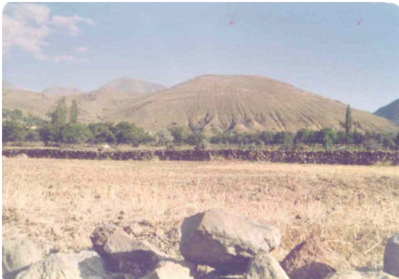
Photo 5: Miniature bad-land topography which can be seen in eroded areas