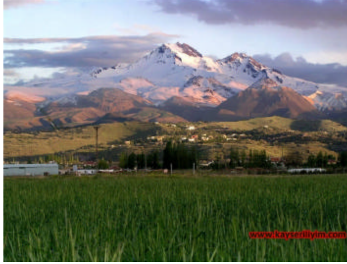
Photo 1: A general view of Erciyes Mountain [1]