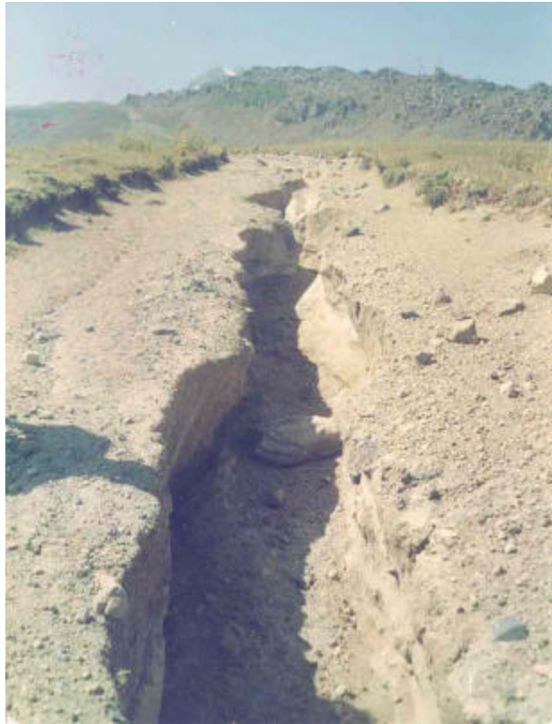
Photo 4: Gullies that have formed as a result of massive destruction