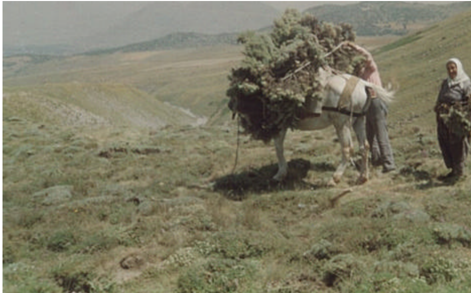
Photo 3: Tragacanth that have been destroyed due to various reasons

Consequently in areas where deforestation occurs erosion has begun, productive soil has been carried away, litosols have become widespread and floods have formed gullies on the topography (Photo 4).