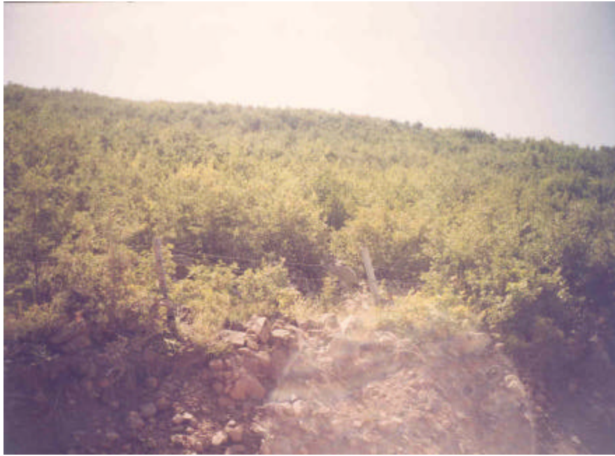
Photo 6: Activities to protect vegetation in limited areas

The plant-water balance of the soil in these areas have been spoilt and soil creatures, especially microorganisms have greatly disappeared. Besides, water flowing on the surface has led to the formation of a topography which has a miniature bad-land appearance (Photo 5).