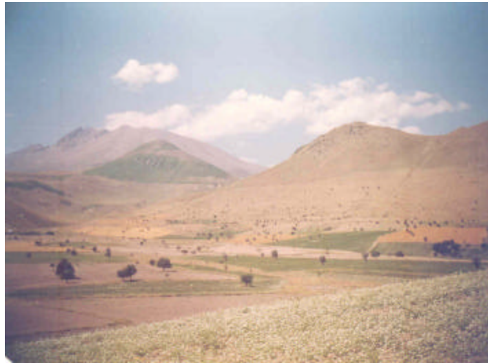
Photo 2: Puny oak trees that have replaced forests as a result of destruction

Mountain during that period (B.C 404), that animals and strangers trespassing on the mountain fell into furnaces and burned [2] and that the reason Kayseri was founded there was the thick forests on Erciyes Mountain [3] gives us important clues on how thick the vegetation was then.