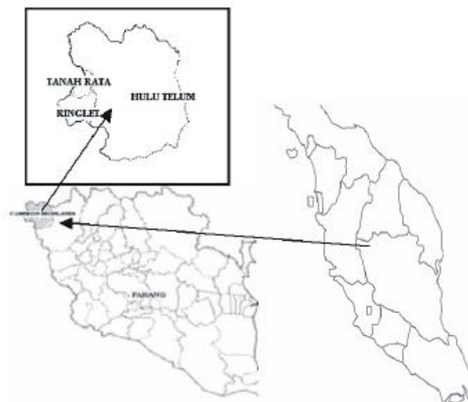
Fig. 1: Maps indicating the location of Cameron Highlands, Pahang

located below the elevation of 1,000 m, whilst two-thirds of the area came within the range of 1,100 to 1,600 m. Figure 1 shows the location of Cameron Highlands with respect to Peninsular Malaysia.