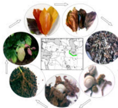
Fig. 1: Geographic distribution of Parrotia persica (green strip on the map) and local cycles of nutrients between leaves litter, decomposers and soil

Site Description: Hyrcanian forests with an area of about 1.9 million hectare are located in north of Iran, in southern coast of Caspian Sea. It is exclusive site for some valuable and unique species like Gleditsia caspica Desf., Parrotia persica C.A. Meyer. and Pterocarya fraxinifolia (Lam.) Spach [25, 26]. The experiment was conducted in 2008 growing seasons in Khalkheil forests (53°E 16' 10" to 53°E 22' 55" N latitude and 36°E 16' 45" to 36°E 21' 35" E longitude) located in north of the IR-Iran. This area experiences a cold mid moist climate; with an average annual precipitation of around 700 mm. The chosen site is located on a south-facing slope, 400-600 m above sea level. Average daily temperature is 14°C. The soils are deep, moderately well drained. They have the textures of loam and loam silt. The Khalkheil forests bedrock is lime marl, sand lime and lime conglomerate. This area has been dominated by the natural forests containing native tree species such as Parrotia persica , Carpinus betulus L., Zelkova carpinifolia , Gleditschia caspica Desp and etc. The surrounding area is dominated by agricultural fields and rural buildings. Figure 1 show the local cycles of nutrients in hyrcanian broad leaved forests of Iran.