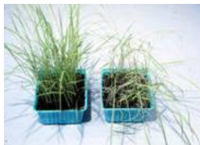
Fig. 3: Rice seedlings (14-day-old) emerged from: Non-treated seeds showing “bakanae” disease caused by F. moniliforme (right); treated seeds with the EO from T. vulgaris (left) showing healthier and greener seedlings