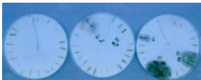
Fig. 4: Portions of rice seedlings (30-day-old) emerged from: non-treated seeds (right) showing black and pink discoloration of blotter by B. oryzae and A. padwickii , respectively; treated with Dithane M-45 (centre) and with EO from T. vulgaris (left) with healthier seedling portions