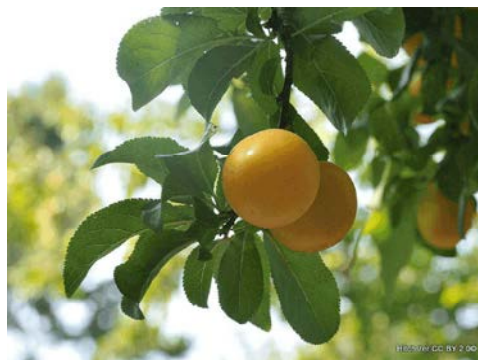
Fig. 1: Plum ( Prunus domestica cv. Golden Drop)

Three projected areas of each plum, i.e. first projected area ( PA_1 ), second projected area ( PA_2 ) and third projected area ( PA_3 ) was also calculated by using equation 2, 3 and 4, respectively. The average projected area known as criteria area (CAE) of each plum was then determined by equation 5.