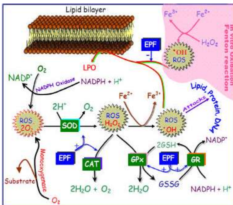
Fig. 2: Possible modulation of reactive oxygen species (ROS) metabolism by ethanol extract of Paederia foetida (EPF), Fenton reaction is shown in the pink shade.

Here, LPO = Lipid peroxidase; CAT = Catalase; SOD = Superoxide dismutase; GPx = Glutathione peroxidase; GR = Glutathione reductase; GSH = Reduced glutathione; GSSG = Oxidized glutathione. (Here, “+” sign denotes acceleration and “-” sign denotes inhibition).